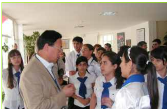
Students surround a Chinese delegate at Modern Education Complex