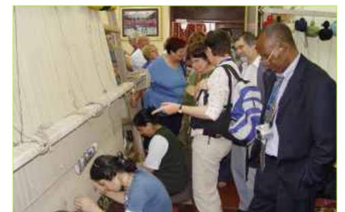
Carpet-makers impress the delegates