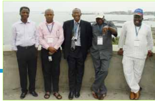
Visit to "Maiden Tower" (VI-XII century)