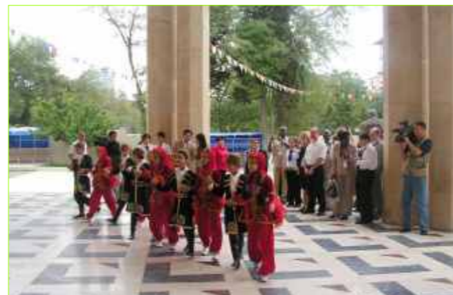
Delegates are met with a children dancing ensemble at Modern Education Complex