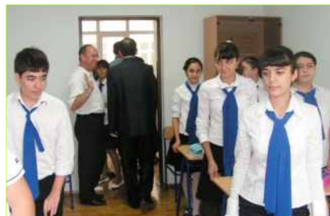
Guests visit one of the classrooms at Modern Education Complex