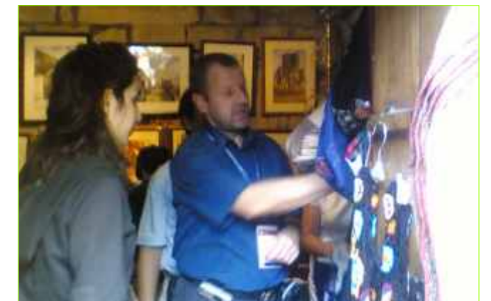
Participants choose presents for their friends and family members