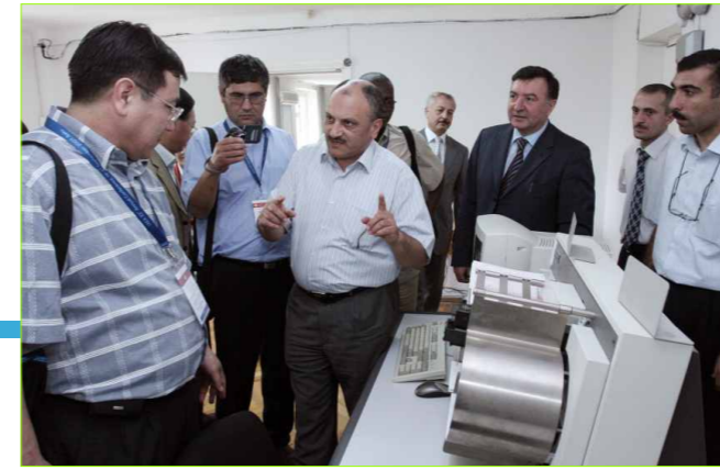
A process of checking out of answers