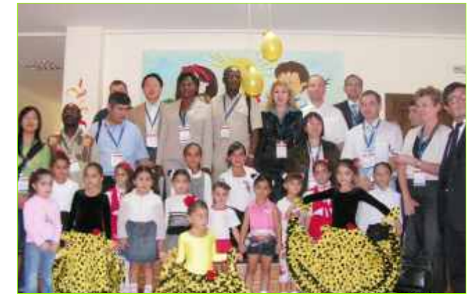
Kids of Modern Education Complex among the delegates