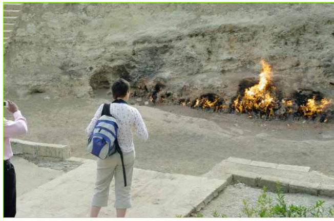
Guests admire miracle of "Burning Mountain"