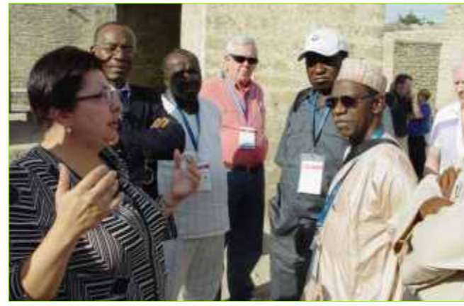
The tour of Ateshgah - historical monument