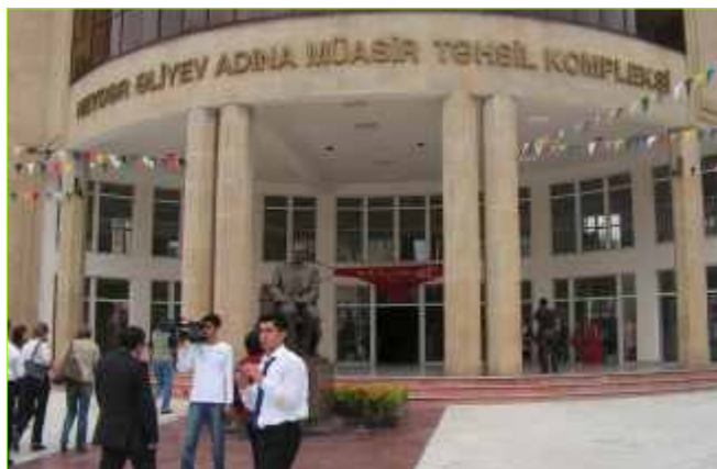
Delegates visit Modern Education Complex named after Heydar Aliyev