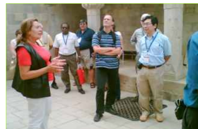
Guests visit the Shirvanshah's palace