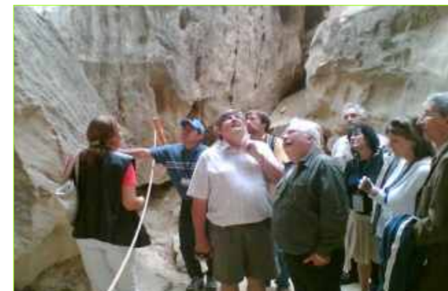
Guests are in Gobustan – ancient part of Azerbaijan